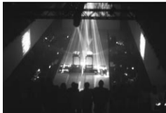
Mar. 2000 "Circulation Module" (at Muffathalle / Munich)