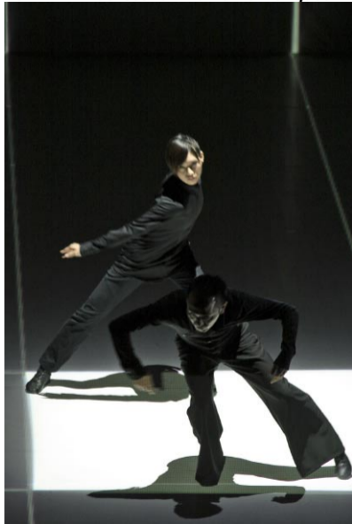
"QWERTY" at festival "Bains Numériques #2" Enghien-les-Bains / France 2007