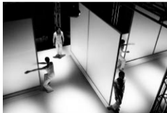
Jul. 2000 "LinkAge" (at Paradiso / Amsterdam)