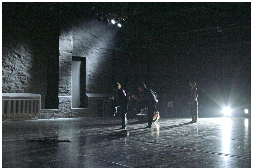
"CatB" at 'TURKU 2011' (European Capital of Culture) / Finland