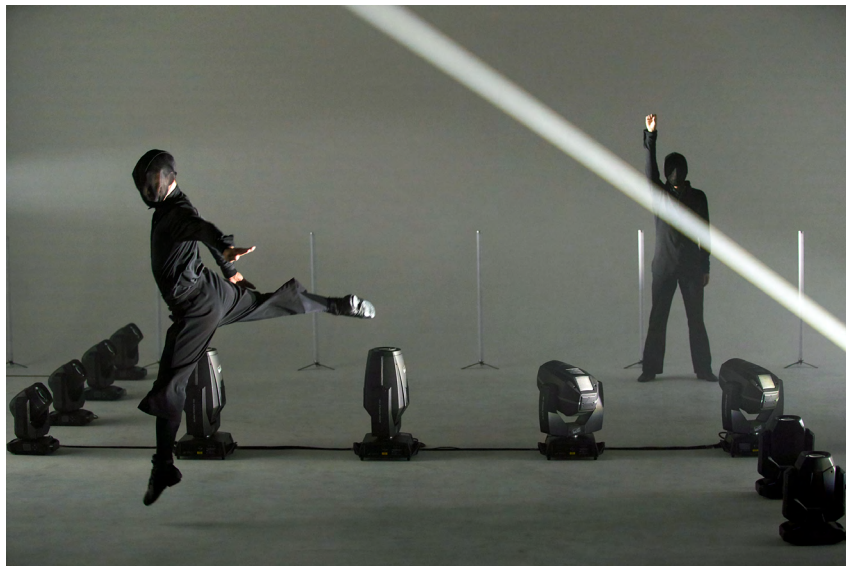
"./ [dot slash] -beta version" at YOYOGI PARK STUDIO / Japan