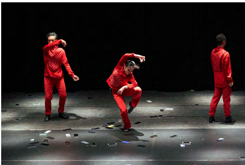
"S.S.S.S." at R's ART COURT / Japan