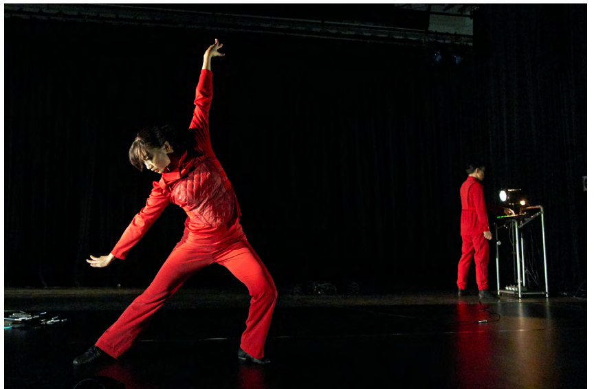
"S.S.S.S." at R's ART COURT / Japan

https://note.mu/unkodayo/n/n57dd24e53162?fbclid=IwAR3pZwGpmBKdUVk23KrEoFbxVjLv-kN_a_kKVpENXiOaa4iXrojmO9e2TiU