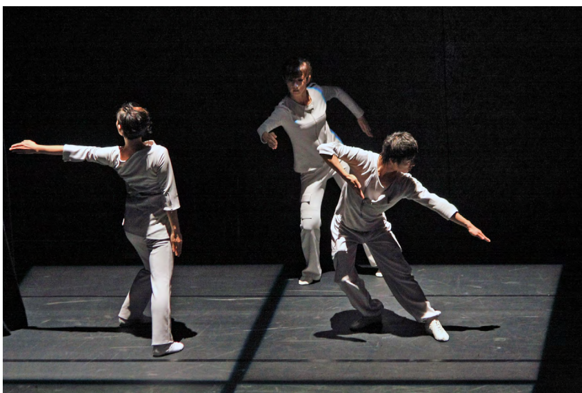
"radi-" at Kawasaki Art Center / Japan