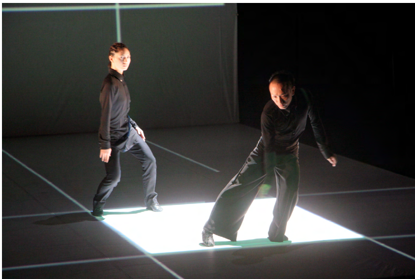
"QWERTY" at New National Theatre, Tokyo / Japan