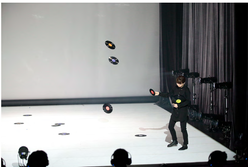
"SHGZR-0dB" at Spiral Hall / Japan