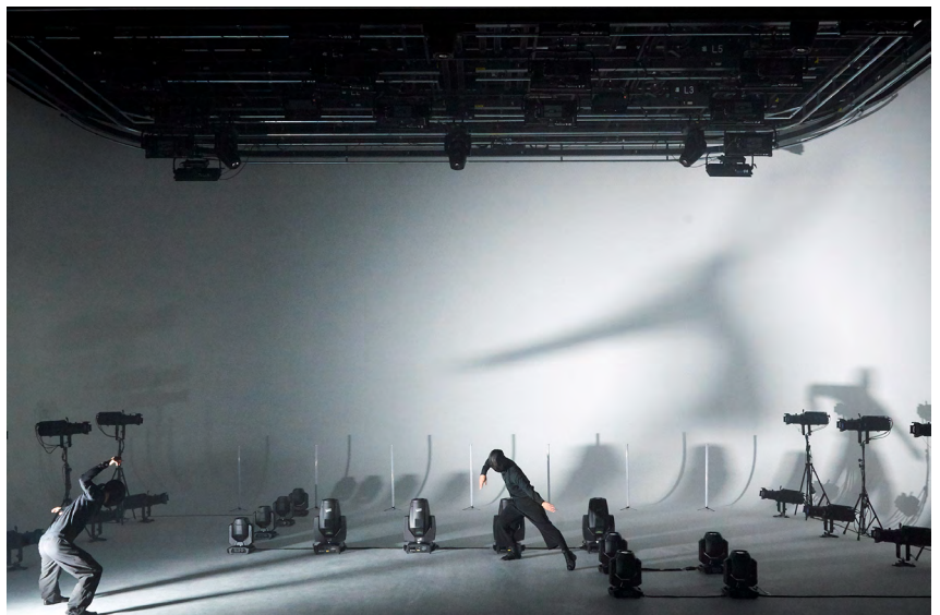
"/ [dot slash] -beta version" at YOYOGI PARK STUDIO / Japan

https://twitter.com/NorikoshiTakao/status/994398125392461824