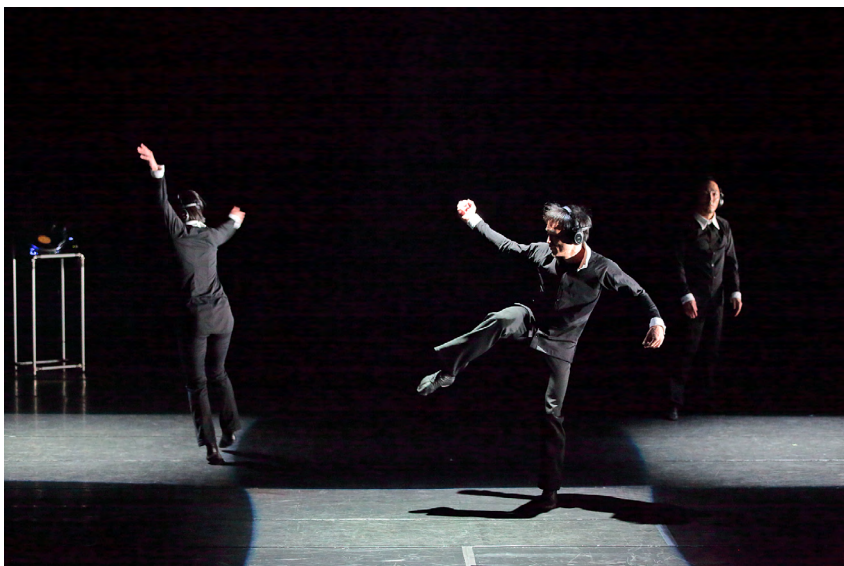
"0dB"(ver.01) at DDD AOYAMA CROSS THEATER / Japan